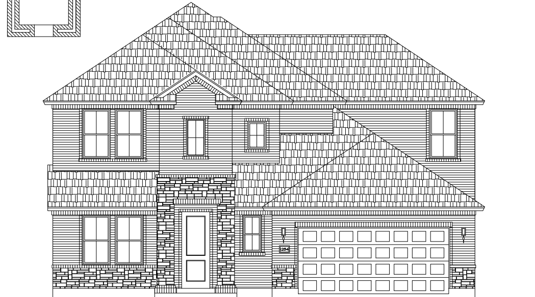
ELEVATION A WITH GAME ROOM