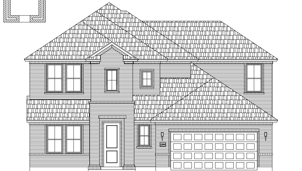
ELEVATION A WITH GAME ROOM STONE UPGRADE AVAILABLE